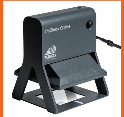
Optima Plus P/N: WEB-Optima-Plus