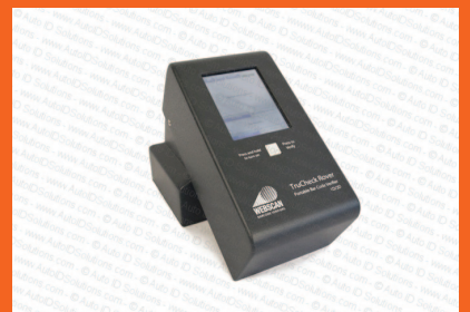
Webscan Rover Wide Angle P/N: WEB-Rover-WA